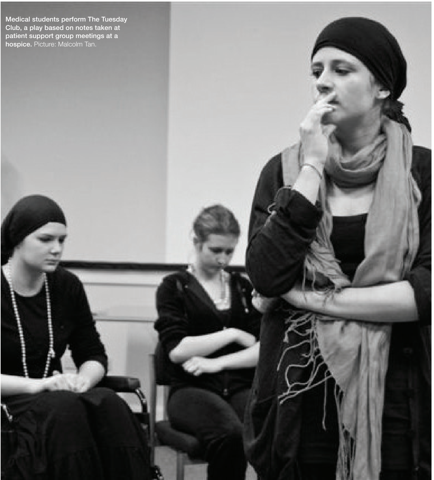
Medical students perform The Tuesday Club, a play based on notes taken at patient support group meetings at a hospice.

More importantly, by making these open events and ensuring that they take place outside normal working hours, new audiences have become aware of BSMS's contribution to the culture of the city.