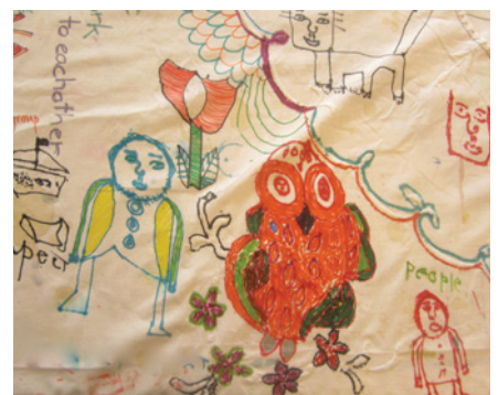
(Top two) Creative representations of important people in our lives.